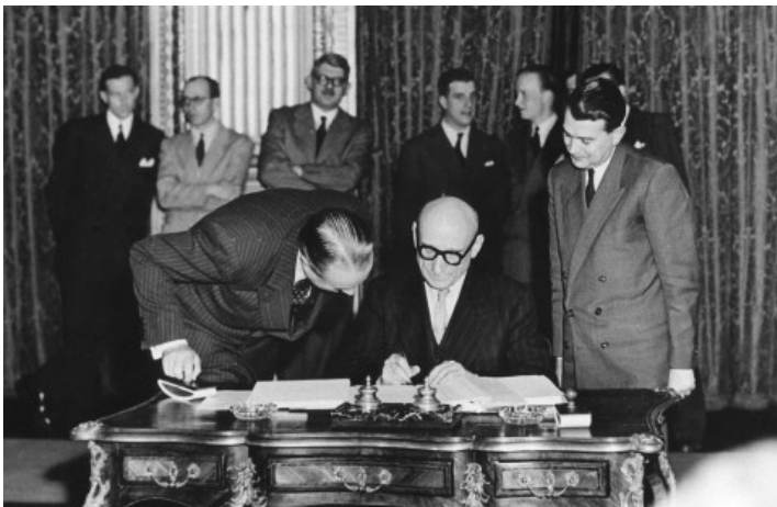
The signing of the Schuman Declaration.

The ECSC turned out to be the first of a series of European institutions which led to the European Union we know today.